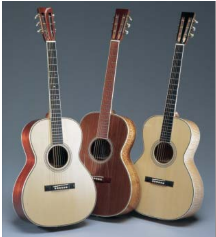
The H 13 Fret shown with some of its many options (L-R): Adirondack spruce top with mahogany sides and back, redwood top with sycamore sides and back, and German spruce with maple sides and back.

Note to editors: Publication-quality high-resolution images of the Santa Cruz Guitar Company's H 13 Fret are available online at: http://www.mulhern.com/press/santacruz .