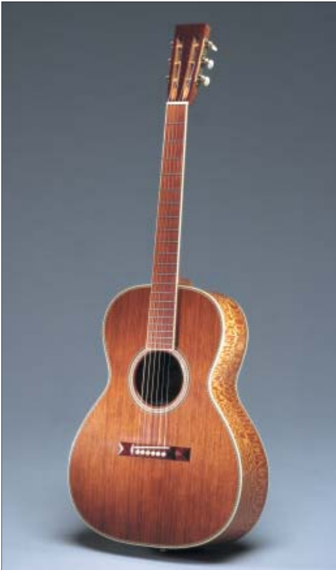
The H 13 Fret with optional redwood top and sycamore sides and back.

Type of guitar: Steel-string acoustic Hardshell case: Included Back and sides: Mahogany Top material: Select Sitka spruce Neck: Mahogany Scale length: 25-3/8" Headstock: Slotted Headstock overlay: Ebony Fingerboard: Ebony Number of frets: 21 (13 clear of body) Bridge: Pyramid ebony (1" x 6" rectangle) Nut: Bone Endpins and bridgepins: Ivoroid Tuning machines: SCGC open-back, 18:1 gear ratio, ivoroid buttons Truss rod: Double-acting, adjustable, designed to counteract forward and backward bowing Neck width at nut: 1-3/4" Spacing at bridge: 2-3/16" Body width: 14" Body length: 19-3/16" Body depth: 4-7/8" Overall length: 39-3/16" Finish: Nitrocellulose lacquer (sunburst optional) Warranty: Lifetime Options: Variety of woods, pickups, inlays